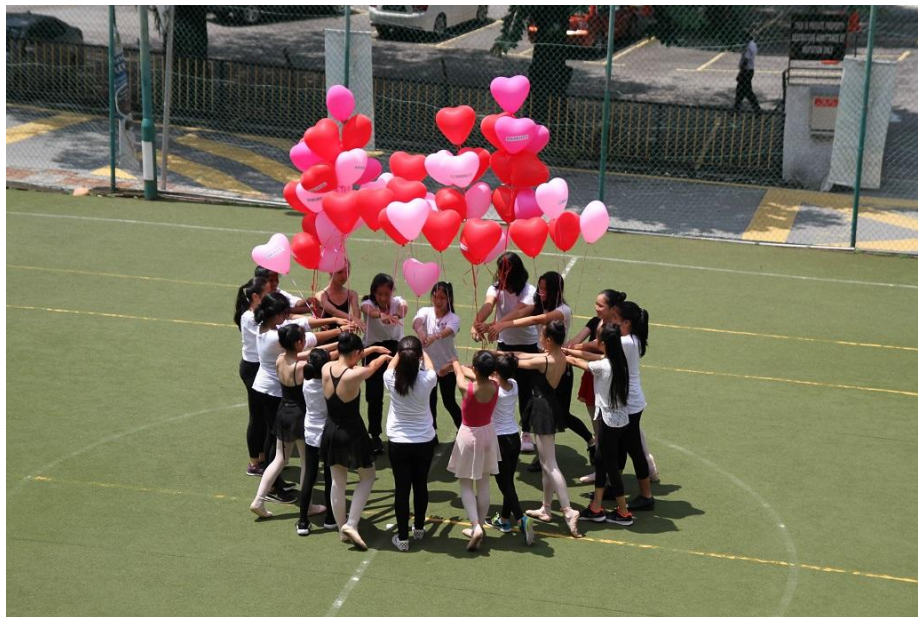
SJIS dancers with heart-shaped pink and red balloons launched the ceremony with an elegant performance.

SJIS is a private international school that offers a British curriculum with the Cambridge Assessment International Education (CAIE) syllabus from Year 7 to A-Levels. SJIS is also an associate La Salle school that is linked to a global presence on every continent. In Kuala Lumpur it is a continued development of St John’s Institution established in 1904 and is located within the same grounds on Bukit Nanas, Kuala Lumpur.