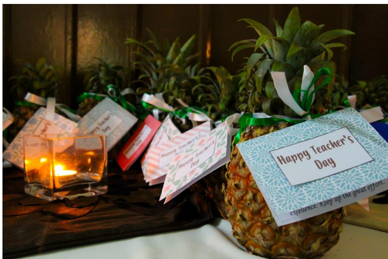
Pineapples representing warmth, generosity and hospitality were given to teachers as tokens of appreciation.